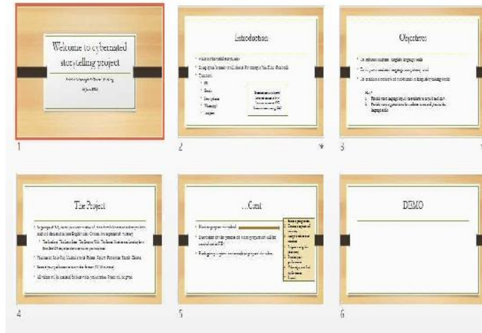
Figure 1. The Process of Cybernatic Storytelling

Finally, the students were briefed on the discussion platforms, WA and FB, which they would be engaged in during the study period. These two platforms were created for closed group only. In WA platform, they would participate in a discussion facilitated by the researcher. That discussion focused on the process they engaged in throughout the activity. FB, on the other hand, featured a discussion among the students about their video project. Students shared pictures of their activities. They would also uploaded preliminary videos to FB for their group members to preview and comment on. Once the group members were satisfied with the video, they uploaded final copies for evaluation. Then, the students were interviewed to determine their perception of the activities. Data from the audio taped interview were transcribed and later coded, as illustrated in Figure 2. The coding is used for each student's responses from the interviews.