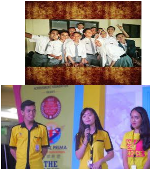
Figure 4: Screen shots of students' videos