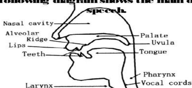
The following diagram shows the main organs of speech.

The various organs which are involved in the production of speech sounds are called the speech organs. According to Szilágyi László (2014:8) there are five speech organs, namely: